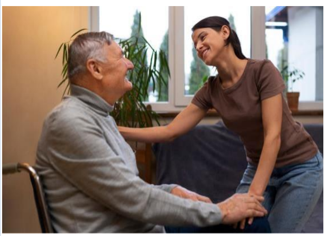
shows an older man in a wheelchair smiling with a visitor

Following consultation earlier this year, we have now published final guidance to help providers understand and meet the new fundamental standard on visiting and accompanying in care homes, hospitals, and hospices.