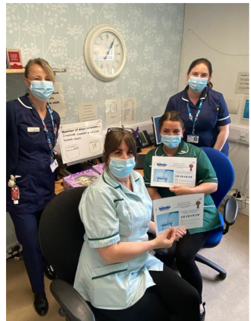
Pictured- Care Team from 5 Whitby Road, Pickering

The programme involves face to face training and the use of workbooks to ex-