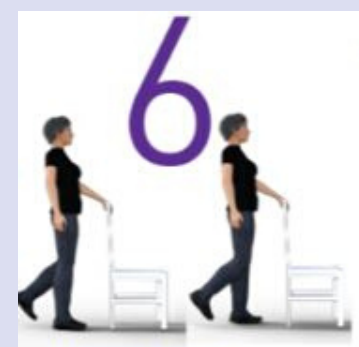
How can I make it more challenging?

This will help to strengthen your ankles and shin muscles.