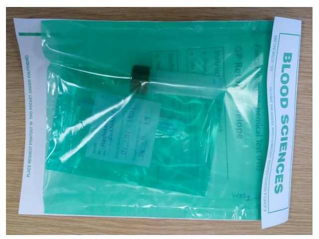
You can put everything in the specimen bag.